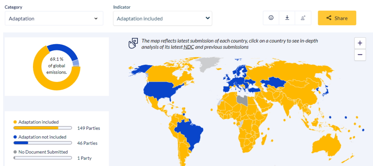
Figure 2: Adaptation inclusion in the revised NDCs (WRI, 2021)

for many countries. Analysis of the policy documents for West Africa on the key sectors of energy, agriculture, water resources, health, forestry, infrastructure, and education showed leanings towards community resilience, disaster risk management, institutional development, and industry development. This analysis highlights the question on the extent to which sector policies support the implementation of the adaptation policies. These need to be unpacked to ascertain policy preparedness by African countries in the implementation of adaptation practices at the sector and local levels.